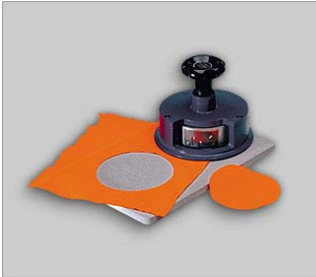
Sample cutter 240.

Circular cutter for material thickness max. 3 mm